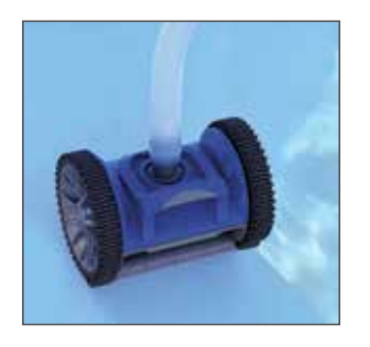
More cleaning power

Sure-Flow Turbine design captures debris, large and small.